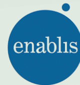
Empowering ideas. Empowering people.